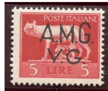
Figure 3. 5 Lire Red Wolf stamp with Type II overprint.

The Type II overprint measures 14 mm in width and 11 mm in height. It only appears on the single regular issue stamp that was produced in a horizontal format, the 5 Lire Red Wolf stamp (Figure 3).