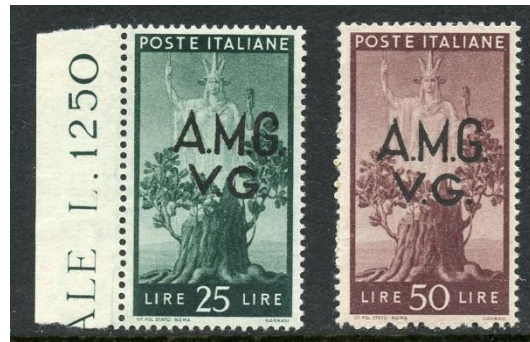
Figure 4. Examples of stamps with Type III overprint.

Type III overprints, which measure 14.5 mm in width and 11.5 mm in height, appear on the two large vertically formatted regular issue stamps picturing Italia and a sprouting oak tree stump. Pictures of the 25 and 50 lire stamps having the Type III overprint are shown in Figure 4.