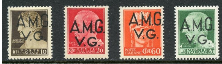
Figure 2. Examples of stamps with Type I overprint.

The Type II overprint measures 14 mm in width and 11 mm in height. It only appears on the single regular issue stamp that was produced in a horizontal format, the 5 Lire Red Wolf stamp (Figure 3).