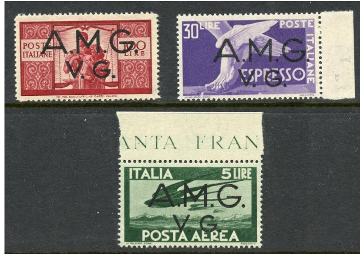
Figure 5. Examples of stamps with Type IV overprint.

If you have comments or corrections, I can be reached via E-mail at rich@pedersonstamps.com or mail at P.O. Box 662, Clemson, SC 29633.